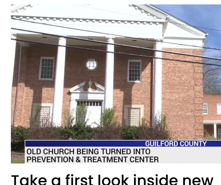
Take a first look inside new prevention, treatment center in Greensboro FOX 8 News - February 29, 2024