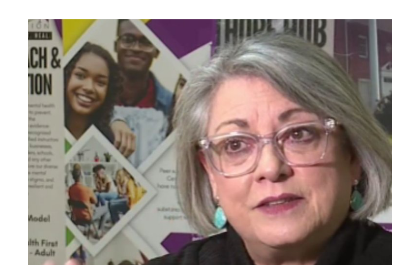
Guilford County nonprofit offers behavioral health services to families Fox 8 News - November 24, 2024