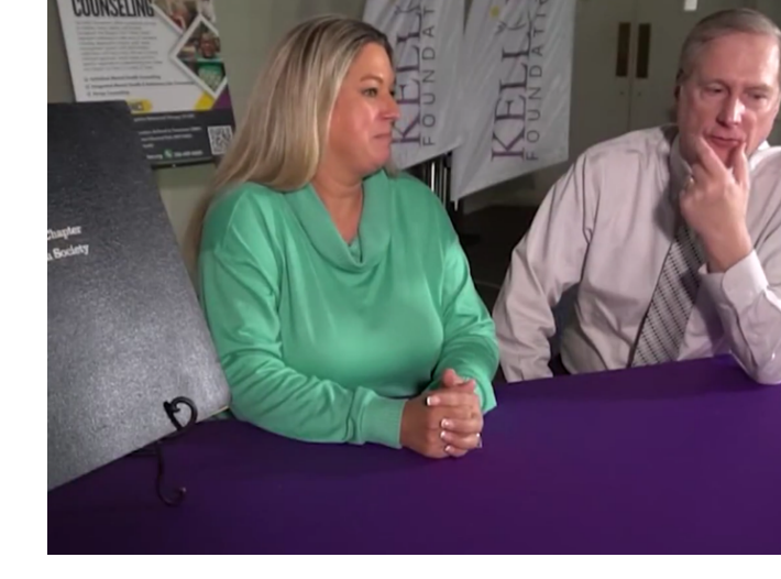
Kellin Foundation serves those in need in Triad FOX 8 News - May 13, 2024