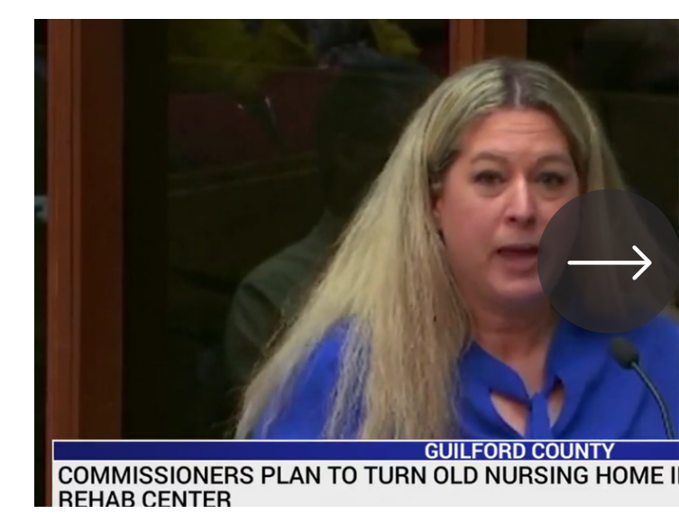
Guilford County planning to buy old nursing home to turn into drug rehab center FOX 8 News - August 8, 2023