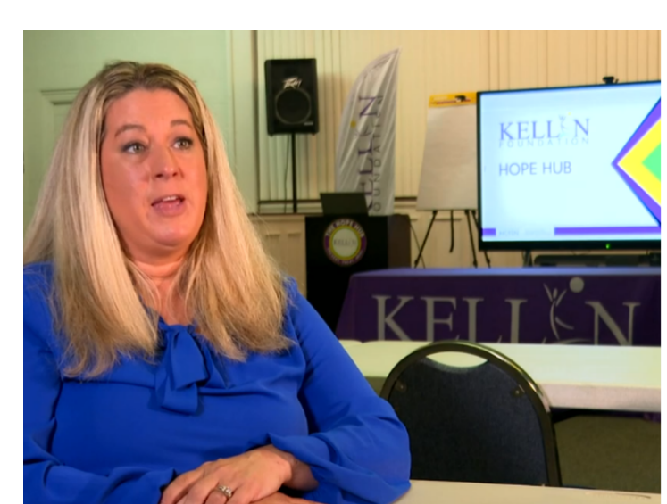
The Kellin Foundation is set to expand Behavioral Health Services WFMY News - May 30, 2024